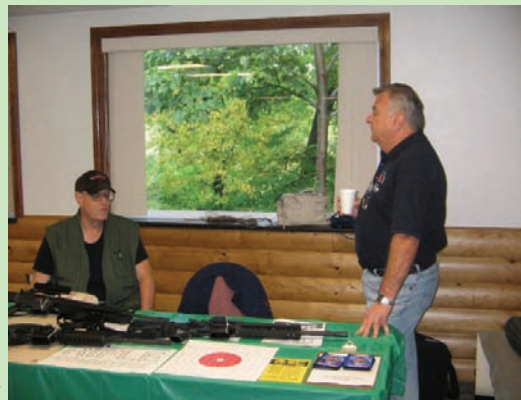
R I - POWER PT. V I E W E D